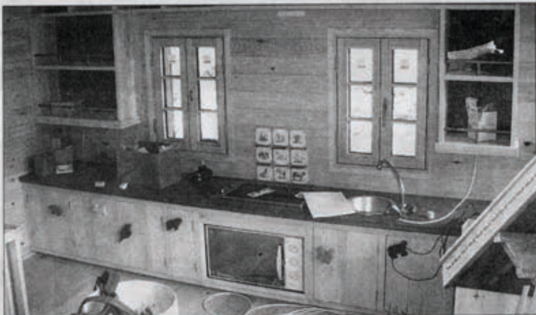
Nothing like a doll's house, a fully-equipped kitchen for when the children are peckish